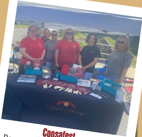
Coosafest Downtown Childersburg on April 23