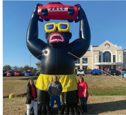
HSCU Annual Car Sale Hwy 280 Branch on April 8-9