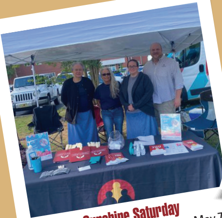
Sunshine Saturday Blue Bell Park in Sylacauga on May 7