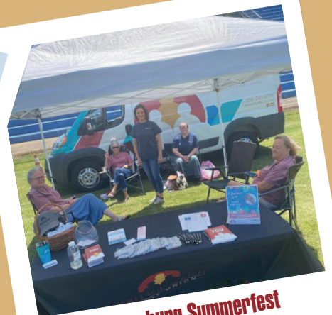
Childersburg Summerfest May 28 in Childersburg