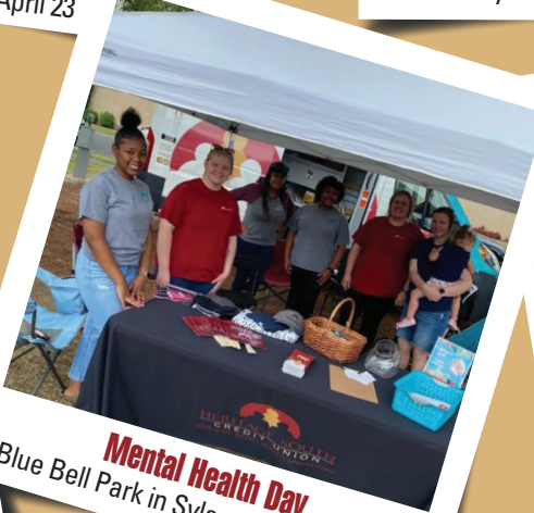
Mental Health Day Blue Bell Park in Sylacauga on May 21