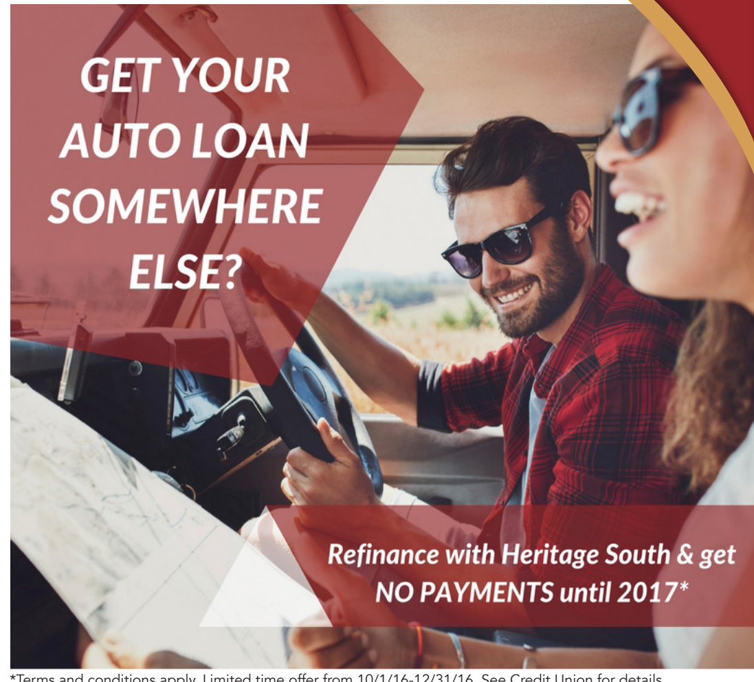
*Terms and conditions apply. Limited time offer from 10/1/16-12/31/16. See Credit Union for details.

*Certain rules and restrictions apply. See credit union for details.