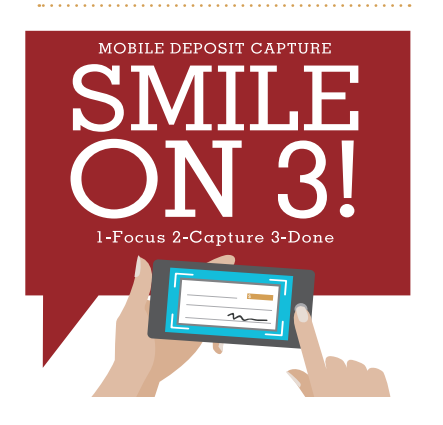
Sign up today for MobileTeller!

This exciting feature inside the MobileTeller App lets you deposit checks from your smartphone or tablet anytime, from anywhere.